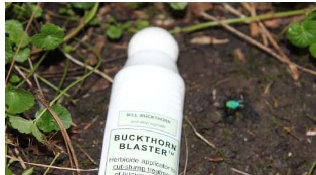
Buckthorn blaster beside treated stump