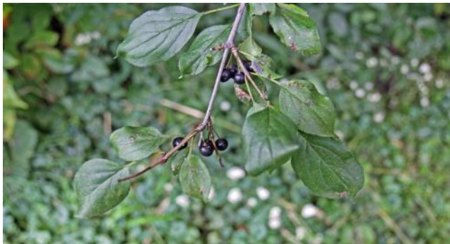
Female buckthorn with berries

Fall is the perfect time to bust our buckthorn because the leaves remain on the plants long after other leaves fall.