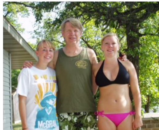
Third Place Zieska Family