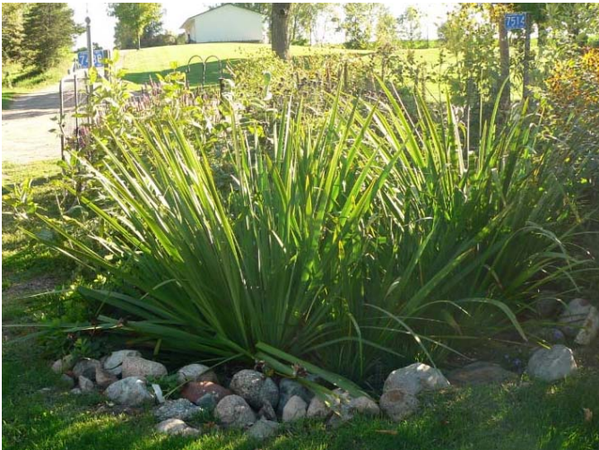
This rain garden is on Karen Sutherland's property in area N. It was planted about two years ago.