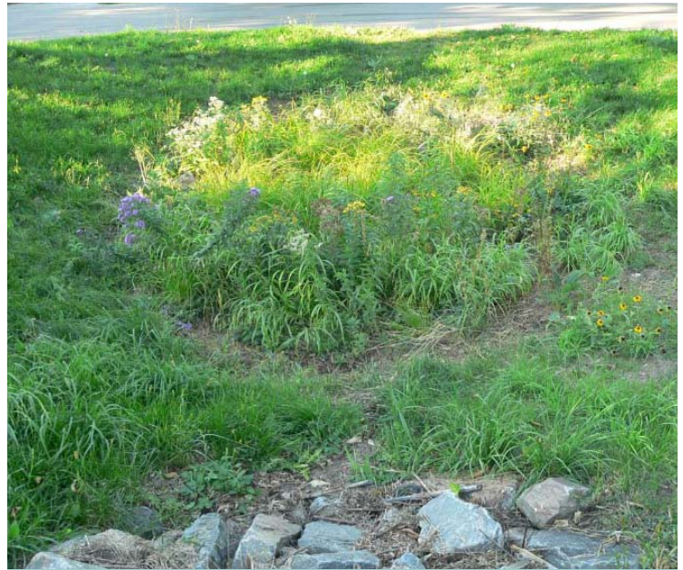
This rain garden is at the south access. It was planted in the spring of 2010.

Rain gardens slow and improve the quality of storm water run-off. The highest levels of sediments and pollution occur early in a rain shower when the impervious surfaces are washed off. We have referred to this in the past as the “first flush.” The “first flush” water is captured by the rain garden. Sediments and pollution present settle out of the water and are absorbed by the plant roots and filtered by the soil.