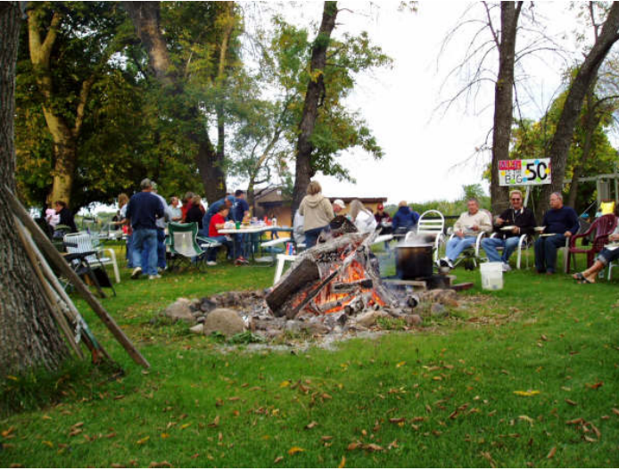
Special events are celebrated along with the Bouya