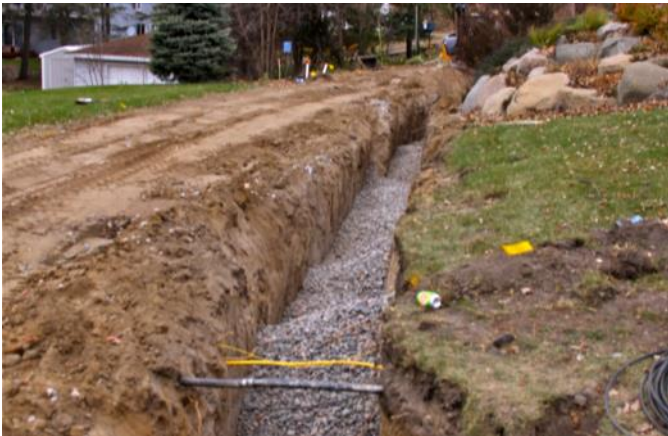
Rock infiltration trench from the south

This was an expensive, but necessary, project for the association to undertake on our own. Our monitoring and sampling in this area over the last ten years made it clear that it was very detrimental to the lake. There are other places around the lake that similar things happen, but not with the same effect. The Water Quality Improvement Committee has been watching and monitoring some of these areas, but we still need your help. We need people to pay attention to where water runs into the lake during a storm and how dirty the water is. We have learned over the years, that if the water is dirty, it is carrying soil and phosphorus with it that harms the quality of Sugar Lake. Be watchful and report to the committee what you find, so we can add it to our action list.