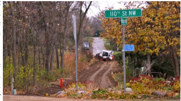
Looking south along Hollister