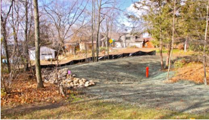
Collection area near 110th & Hollister