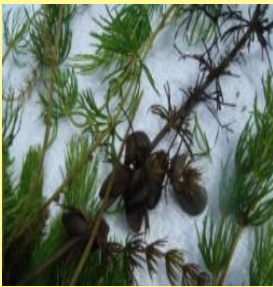
Zebra Mussels can attach to aquatic plants