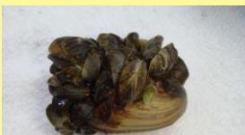
Zebra Mussels on a native clam ALSO: Zebra Mussels deplete food supply for native fish