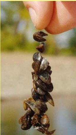
Juvenile Zebra Mussels are small