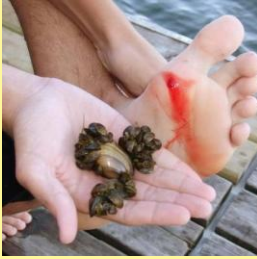
Zebra Mussels impact recreational use of lakes

VISIT www.dnr.state.mn.us for more information