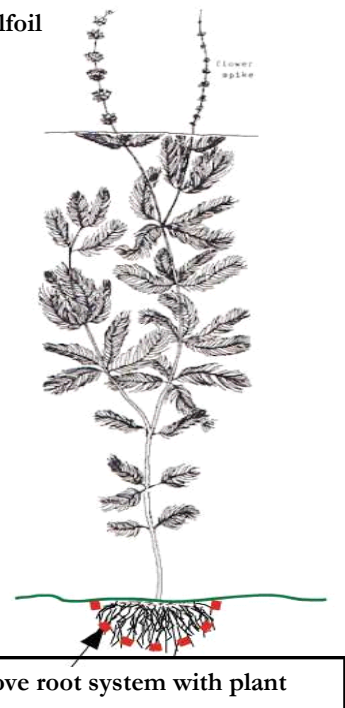
Eurasian water milfoil "EWM"

Hopefully this sketch can help you to understand the task.