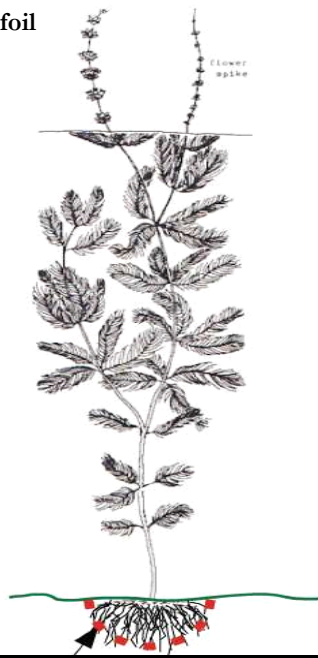
Eurasian water milfoil "EWM"

Hopefully this sketch can help you to understand the task.