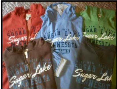
The 5 pre-printed garments are here now, in sizes S - 2 XL

The 3 full zip jacket samples (L to R: Rust with Gray trim, All Black, Coral with 3/4 length sleeves) will be ordered at the picnic and can be embroidered locally with a Sugar Lake design on the upper left chest. Order now as a nice gift for Mom!