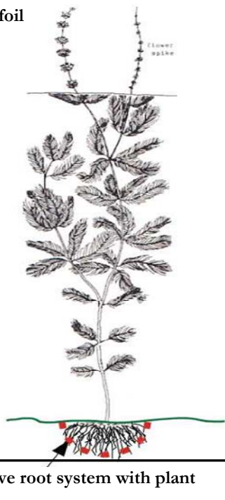
Eurasian water milfoil "EWM"

Hopefully this sketch can help you to understand the task.