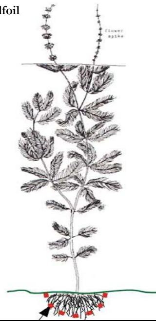
Eurasian water milfoil "EWM"

Hopefully this sketch can help you to understand the task.