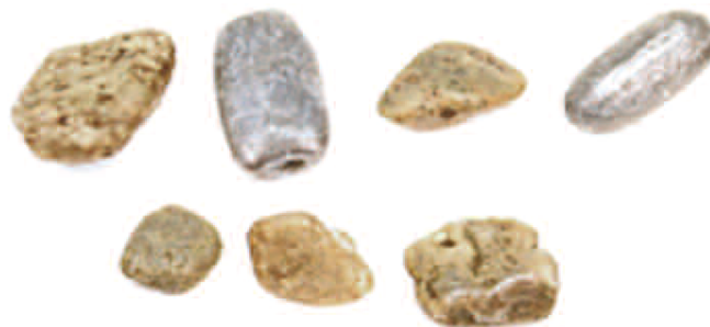
These pebbles and sinkers were found in the gizzard of a lead-poisoned loon. Loons mistake lost weights for pebbles they eat to grind their food.

This information comes from a fact sheet produced by the Minnesota Pollution Control Agency. For more information (including a list of lead tackle exchange events, how to order educational kits, and a list of lead-free alternative retailers and manufacturers) or to download the fact sheet, visit http://www.pca.state.mn.us/oea/reduce/sinkers.cfm .