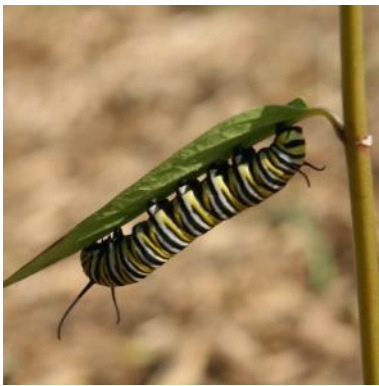
Monarch larva on milkweed at the South public access

You can help! A 4' x 4' sunny corner of your property is all it takes to attract monarchs. Keep any milkweed that has volunteered. Supplement it with some of the plants listed above or pictured below. Promise not to spray with insecticide.