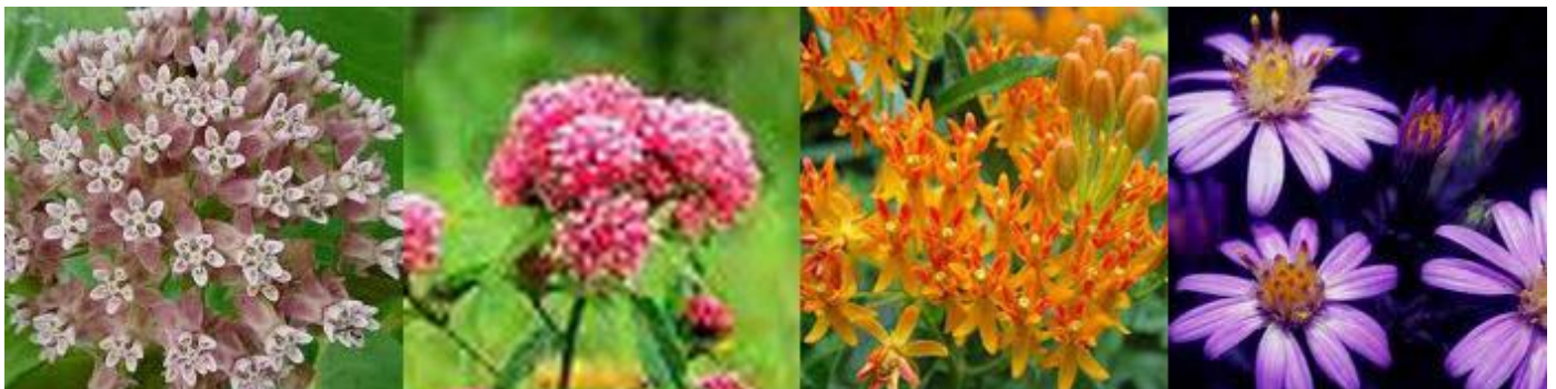
L to R: common milkweed, swamp milkweed, butterfly weed, smooth blue aster

Imagine our large garden at the access supplemented by small sanctuaries of butterfly friendly plants scattered around the lake. Some of our members recall when swarms of monarchs passed across Sugar Lake on their way south. These special critters now need our help.